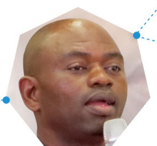
S'bu Zikode Abahlali baseMjondolo (South Africa)