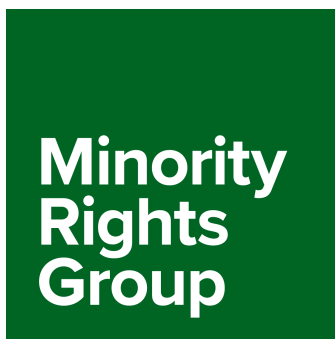
Minority Rights Group