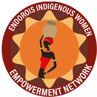
Endorois Indigenous Women Empowerment Network