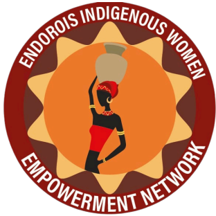
Endorois Indigenous Women Empowerment Network

الشبكة العالمية للحقوق الاقتصادية والاجتماعية والثقافية