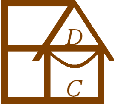
Endorois Welfare Council