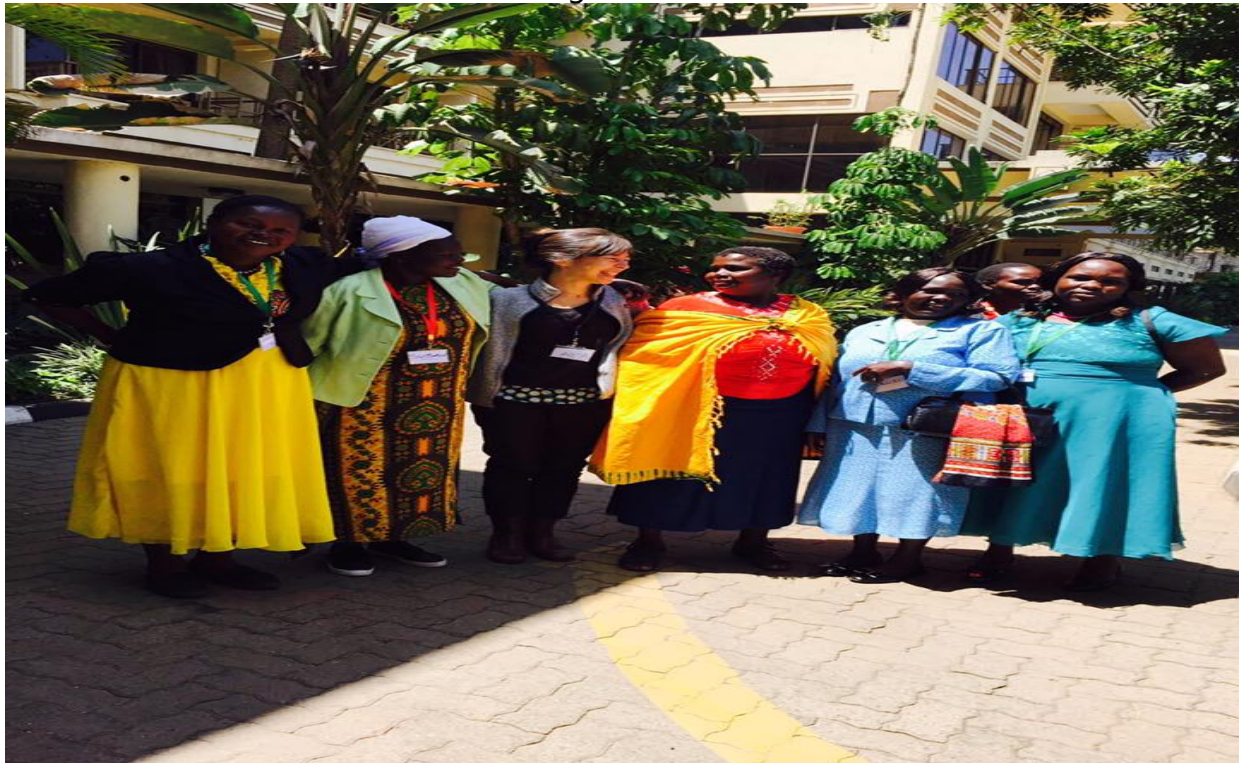
Endorois women participating in a capacity workshop organized by EWC and ECSR -Net in 2016