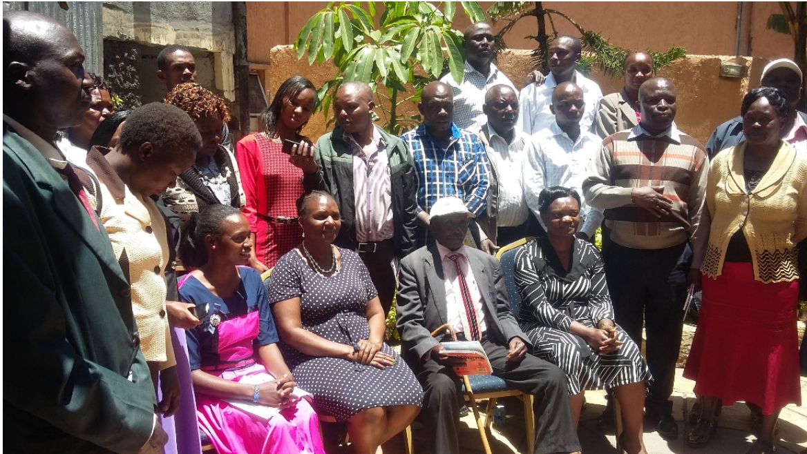
Endorois Welfare Council and Kenya National Human Rights Commission meeting in Nakuru