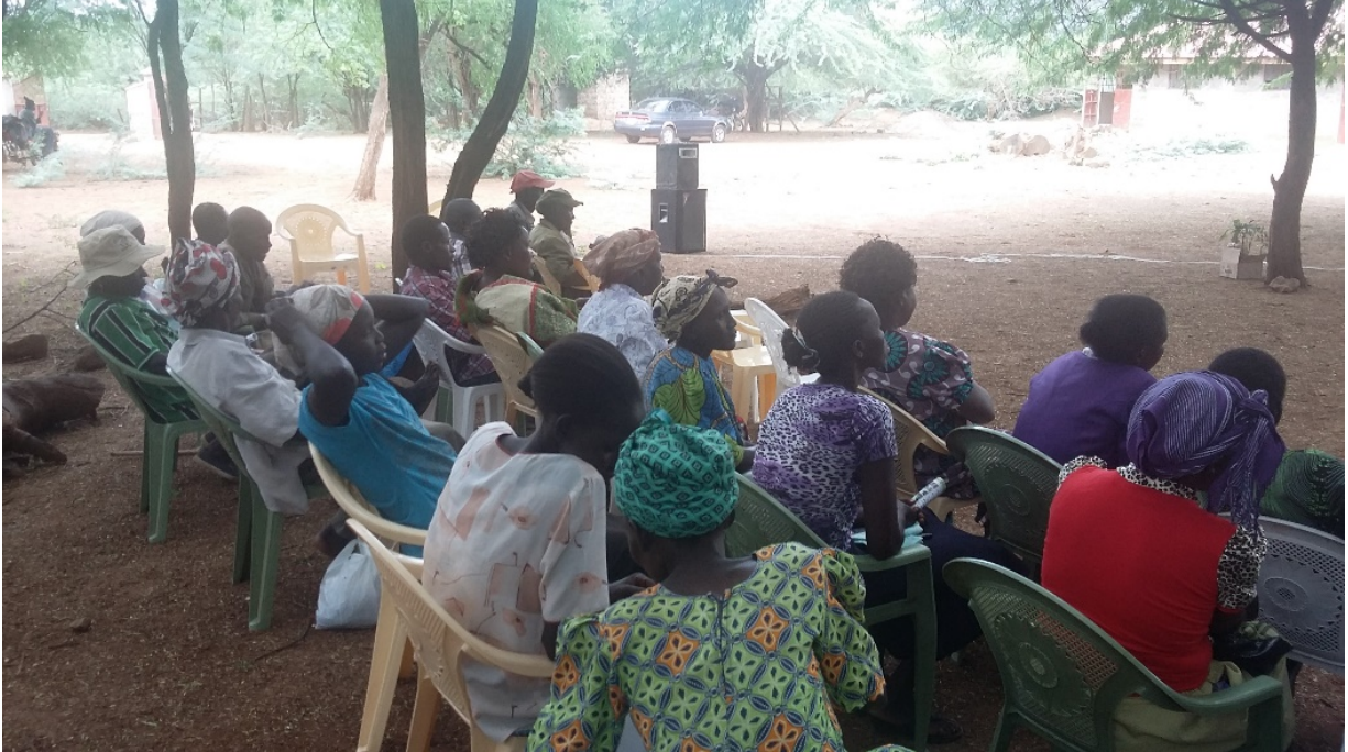
Field based training for the Endorois women