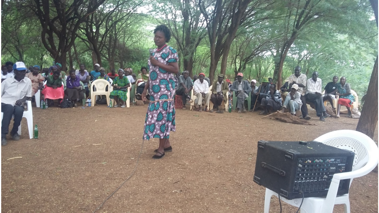
A member of the Endorois Women Forum addressing community members during an outreach meeting at Endorois cultural centre in Lobi.