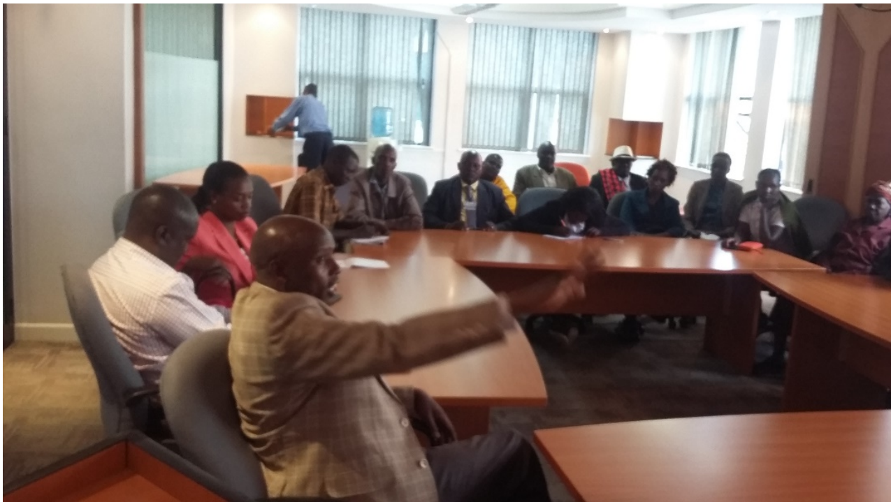
EWC leaders at the KNHRC boardroom in 2016