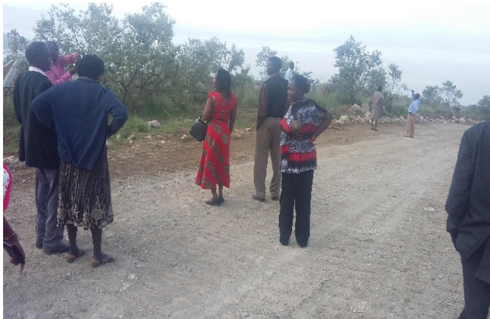
Members of the Endorois Women Forum and EWC elders during an exchange visit to Hell's gate national park and Olkaria Geothermal plant in Naivasha